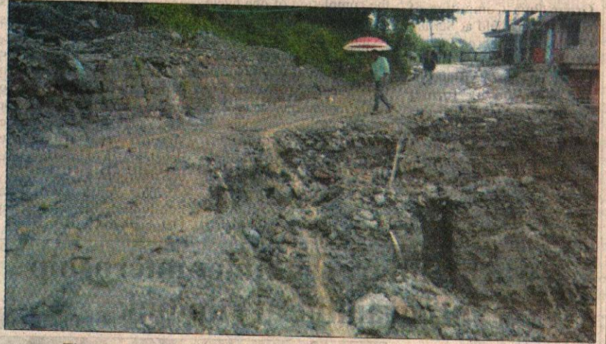
The condition of the road between Pakyong and Bhanuturning. SE Pic

Singh told the meeting that the airport construction work