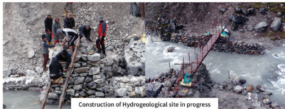
Construction of Hydrogeological site in progress