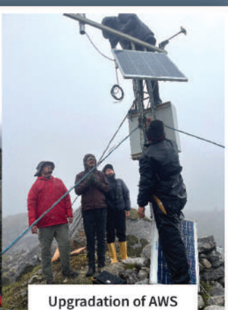
Upgradation of AWS