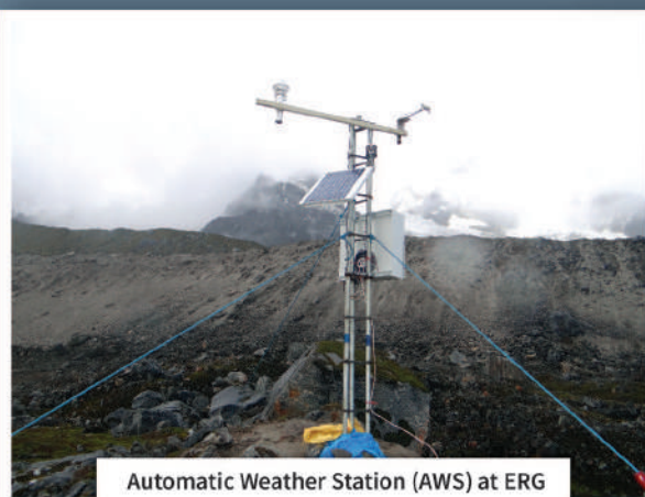
Automatic Weather Station (AWS) at ERG