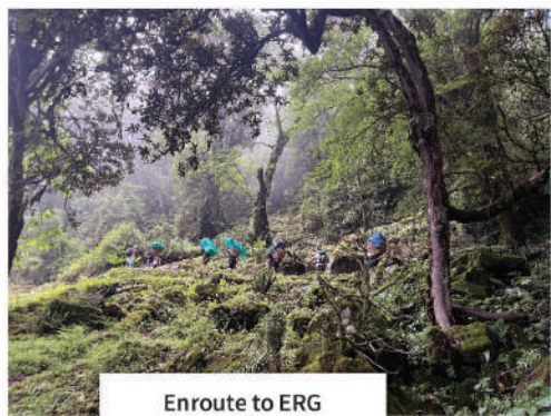
Enroute to ERG