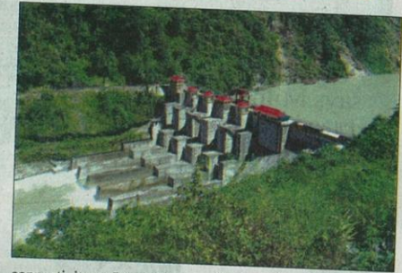
connectivity to Lum village and other villages in North Sikkim will be restored, it stated.

According to the power station, the slide clearance work could not be started due to continuous rain and shooting boulders from the top. Once weather condition improves, the slide removal work will start and